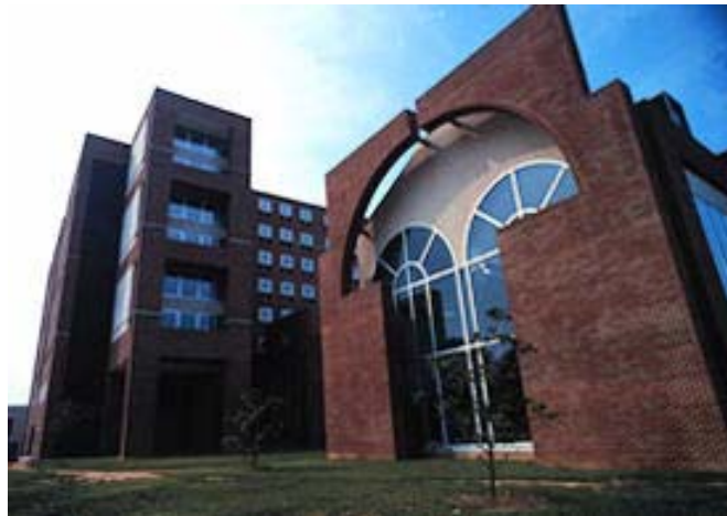
The Walter Royal Davis Library University of North Carolina