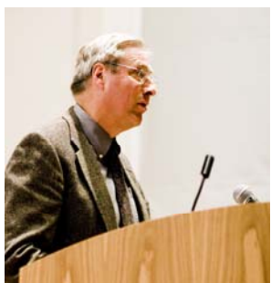
Christopher Browning presents his paper at the King's College Colloquium