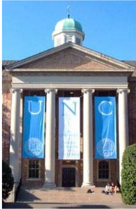
South Building University of North Carolina