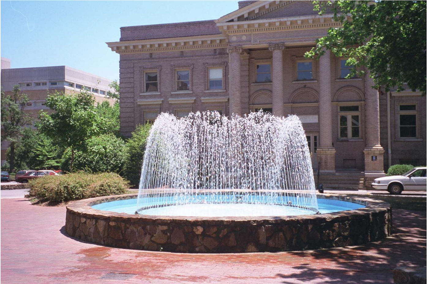
Fountain outside Bynum Hall Graduate School Office University of North Carolina