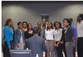
Harmonyx, a cappella ensemble Black Student Movement