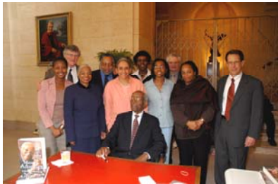
John Hope Franklin with UNC faculty & graduate students