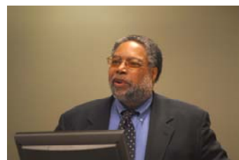
Lonnie G. Bunch, III