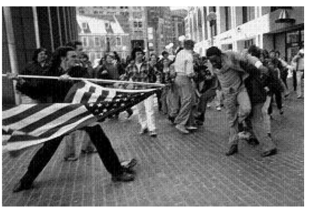
Boston Anti-Busing Rally, 1976