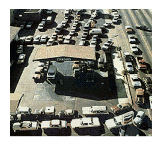
Lining up for gasoline, 1973