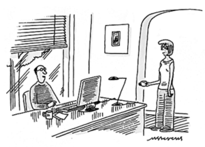
"I wrote another five hundred words. Can I have another cookie?"

Read your group's pages and come prepared to discuss them.