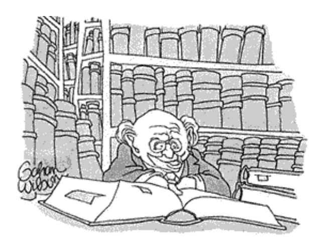
"By God, for a minute there it suddenly all made sense!"

Note: If revisions aren't quite done by the final day of class, you may ask me for an extension until December 11.